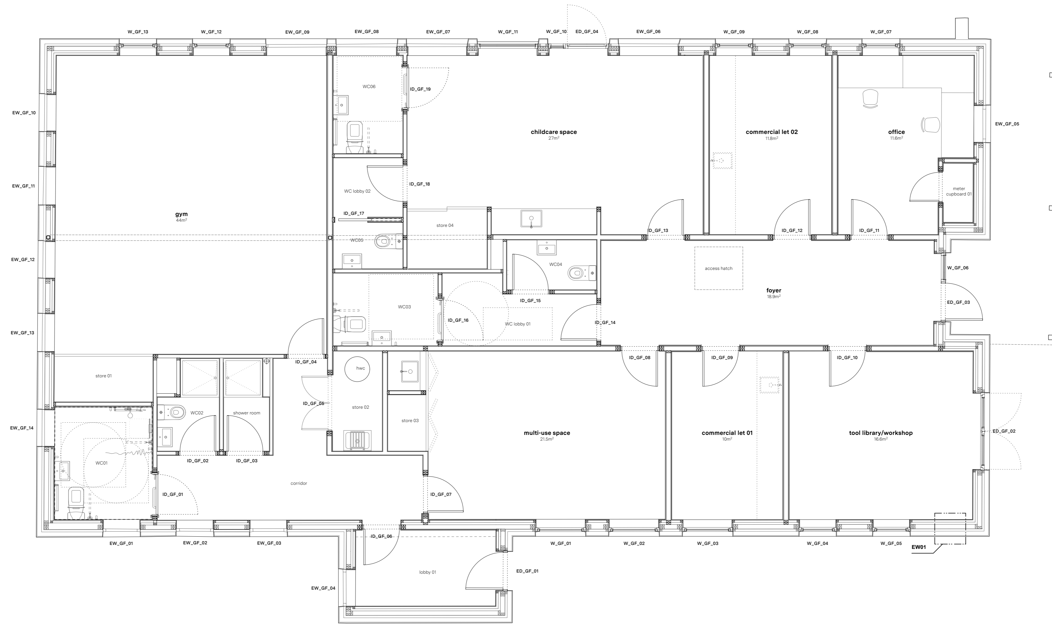
BUILDING 1 / GROUND FLOOR / GENERAL ARRANGEMENT PLAN 1:50@A1 / 1:10@A3

Detail EW01 External Wall Render-on-Blockwork Plan // 1:10@A1 / 1:20@A3